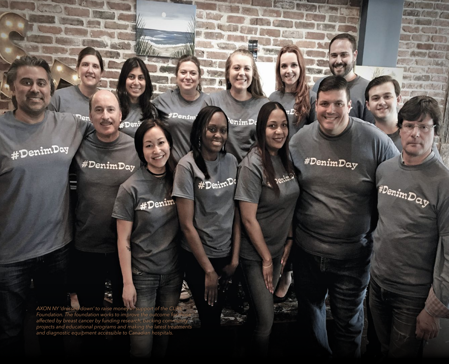
AXON NY 'dressed down' to raise money in support of the CURE Foundation. The foundation works to improve the outcome for those affected by breast cancer by funding research, backing community projects and educational programs and making the latest treatments and diagnostic equipment accessible to Canadian hospitals.