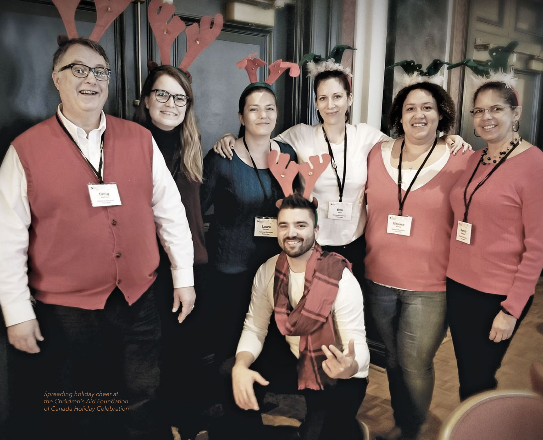
Spreading holiday cheer at the Children's Aid Foundation of Canada Holiday Celebration