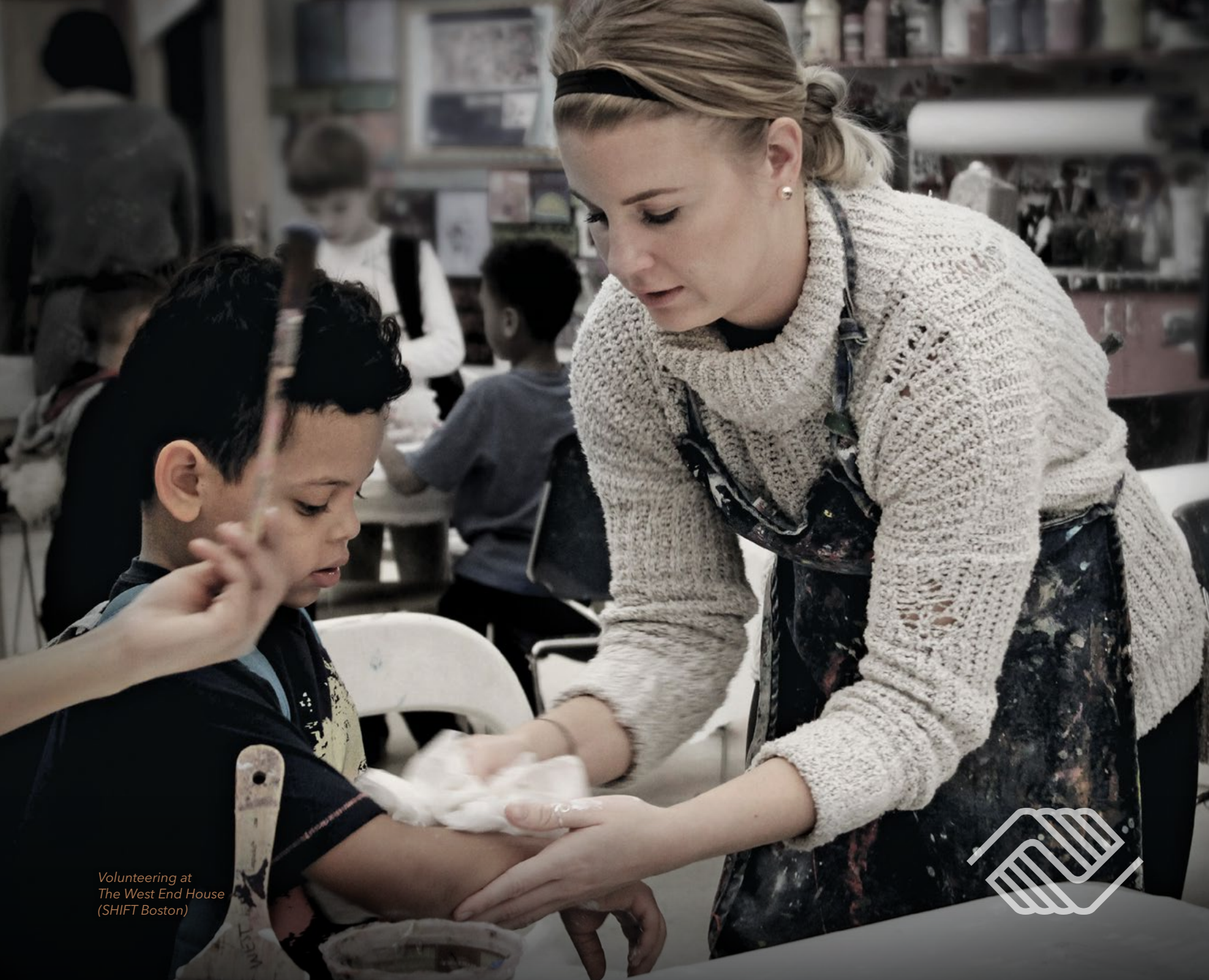
Volunteering at The West End House (SHIFT Boston)